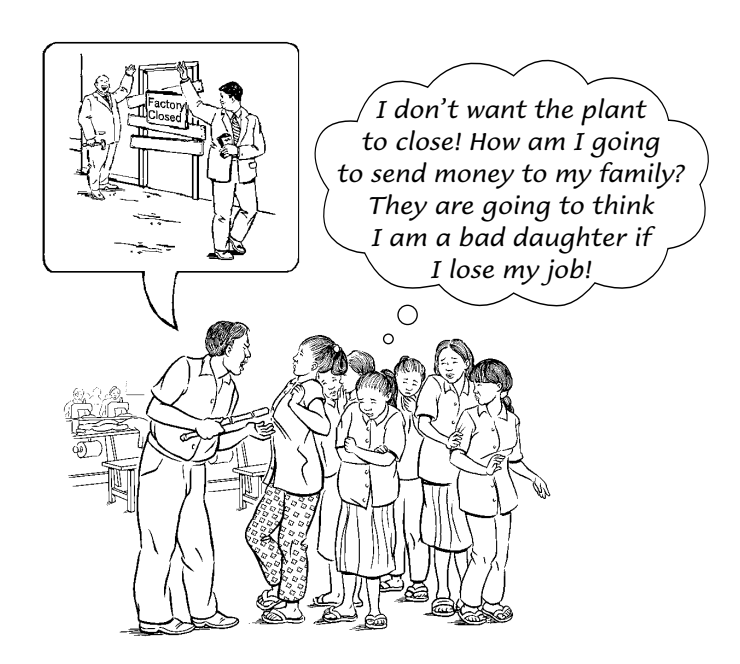
Fear of losing your job is used by employers to get away with not fixing conditions that harm workers.

People work in factories because they need to earn money. And when income is not certain, when unemployment threatens the survival or well-being of your whole family, this can create fear and stress for the worker. Factory owners often threaten to cut back jobs or to move away, making workers fear for their jobs. Since many employers threaten to fire workers who complain, fear can keep you quiet in the face of injustice.